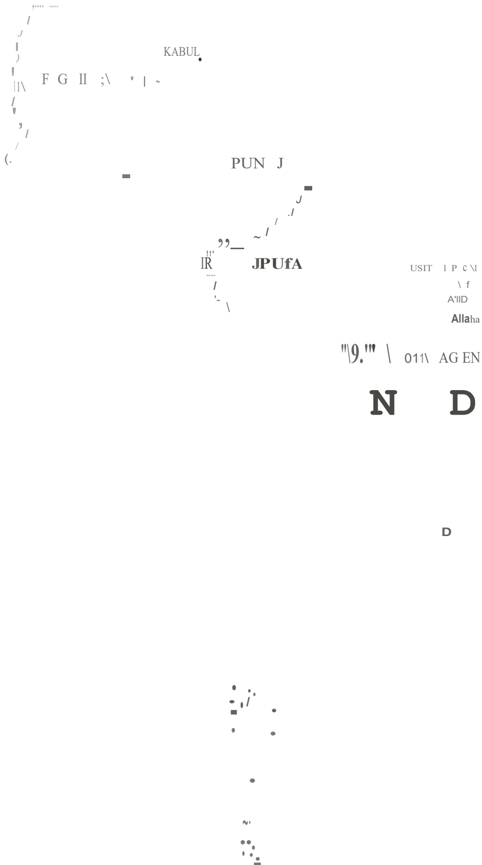
MAP 4: British India and the princely states, c. 1904