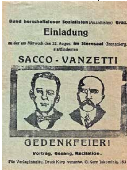
Fig 13: Invitation to a memorial by the B.h.S. Graz on August 22, 1928, for the one year anniversary of the judicial murder of the American anarchists Niccola Sacco (1891–1927) and Bartolomeo Vanzetti (1888–1927). Graz, 1928.

(Ortsgruppe Graz der Internationalen Frauenliga für Frieden und Freiheit in Oesterreich), which was only officially dissolved in September, 1936. Furthermore, there were contacts with the also informally-organized Graz group of the “International Association for Self-Disarmament” (Internationalen Verbands für Selbstabrüstung), started in February 1924.