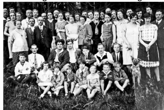
Fig 17: Excursion of members of the former B.h.S. in the Graz surroundings. Circa 1934.