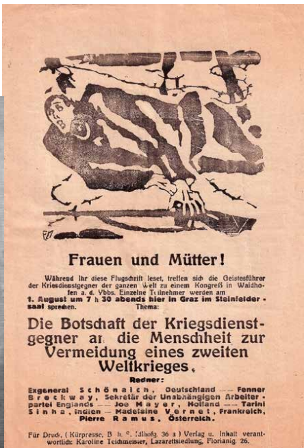
Fig 10: Invitation of the B.h.S. and the League of War Service Resisters to a demo against war in Graz on August 1, 1928 with speakers who took part in the conference of "War Resisters International" in the Lower-Austrian town of Sonntagsberg. Front side of the flyer. Graz, 1928.