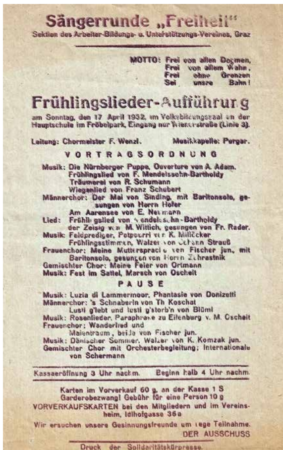
Fig 7: Invitation of the “Singer Circle Freedom” of the B.h.S. to a “Spring Concert” in Graz on April 17, 1932. Graz, 1932.