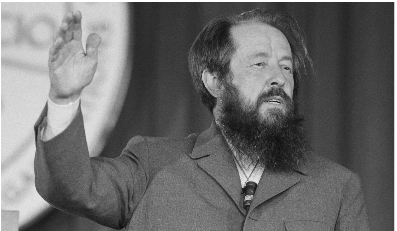
Aleksandr Solzhenitsyn in 1975

By ALEKSANDR SOLZHENITSYN | December 11, 2018 6:30 AM